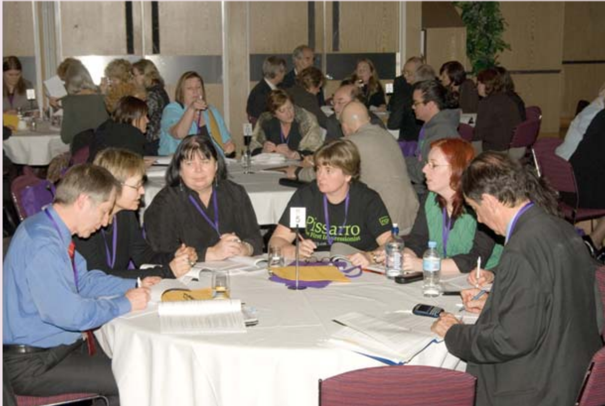
Archives, galleries, libraries and museum representatives at the CCA Digital Collections Summit 2006